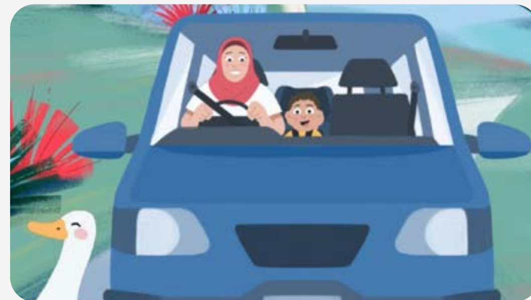
CHILD CAR RESTRAINTS