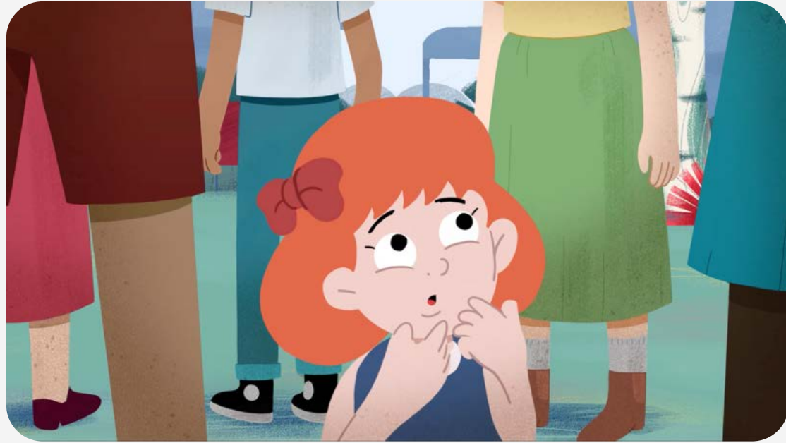
NOTHING IS EVERYTHING