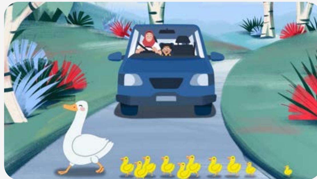
CHILD CAR RESTRAINTS