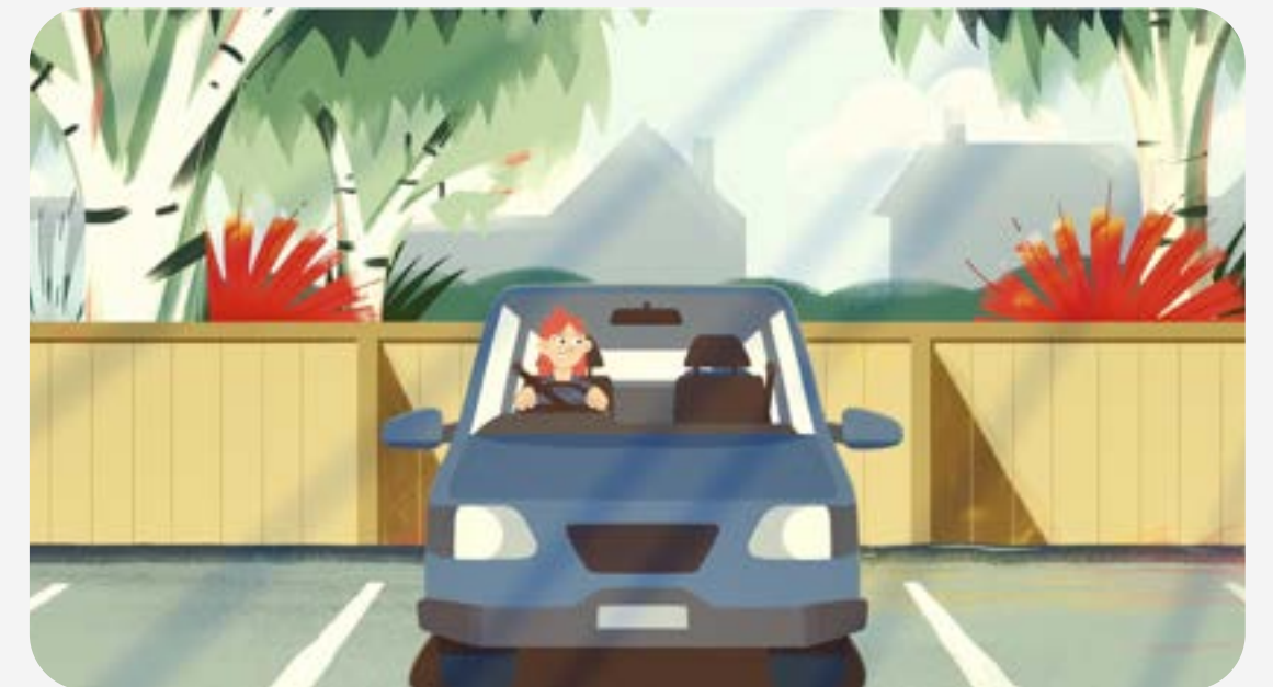
CHILDREN LEFT UNATTENDED IN CARS