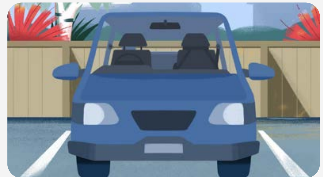
CHILDREN LEFT UNATTENDED IN CARS