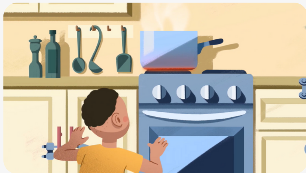
BURNS AND SCALDS

Please click on the image titles to download a copy