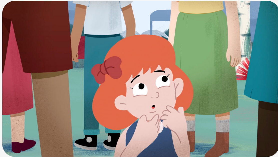
NOTHING IS EVERYTHING