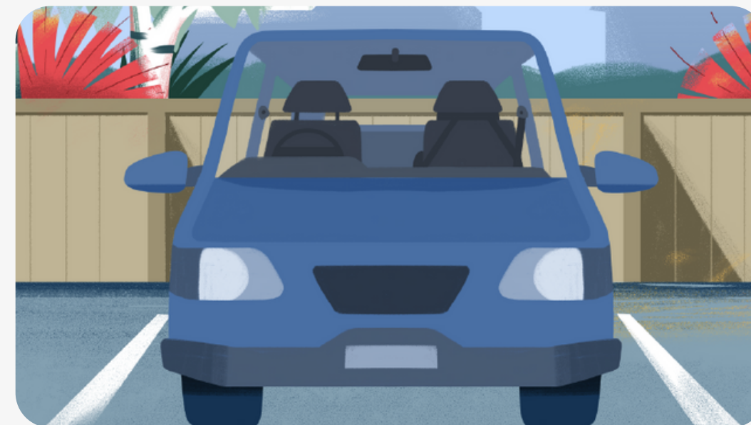
CHILDREN LEFT UNATTENDED IN CARS