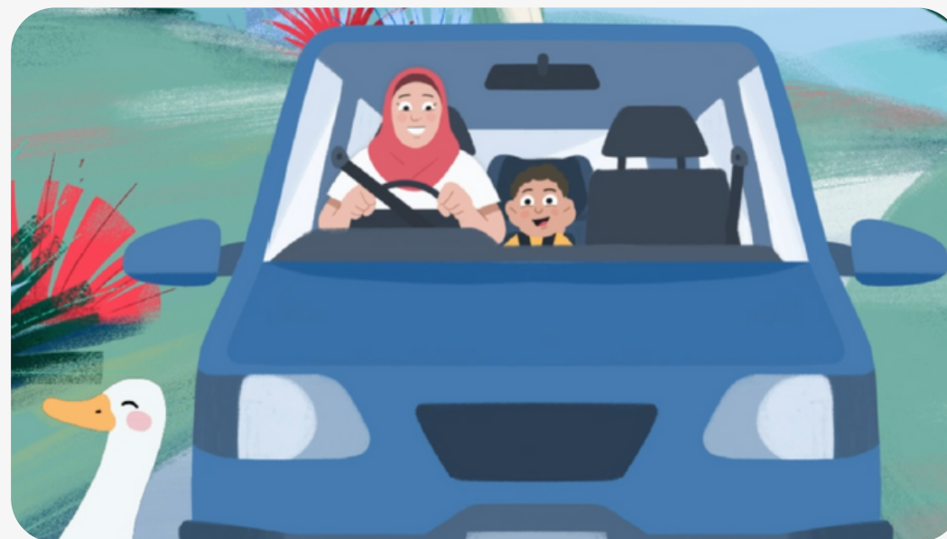
CHILD CAR RESTRAINTS