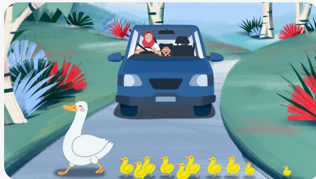
CHILD CAR RESTRAINTS