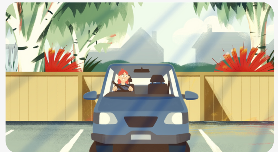
CHILDREN LEFT UNATTENDED IN CARS